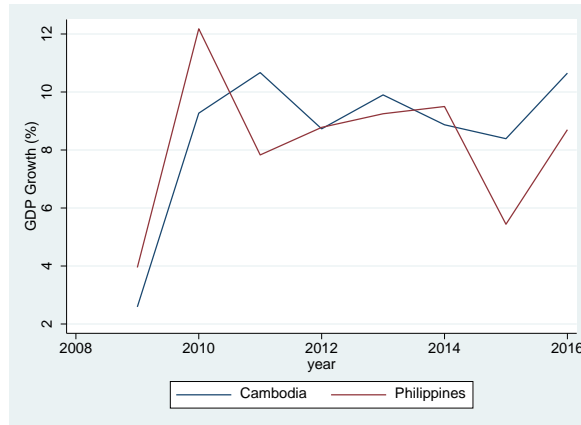
Figure 1: GDP Growth in Cambodia and the Philippines